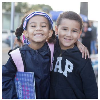
Our mission is to improve the lives of impoverished children in our community through philanthropy, dedicated service and compassionate programs.